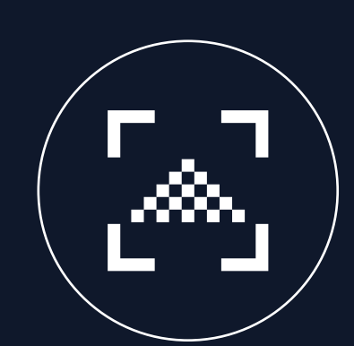
1920*1080 Screen resolution